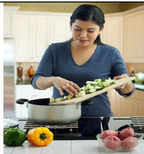
8 _____ dinner