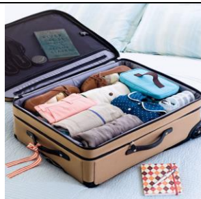
6 _____ for a trip