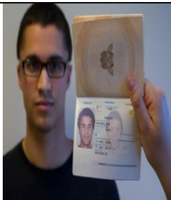
7 _____ the passport